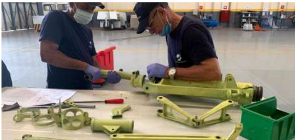
LANDING GEAR C14 (MLG-BRAKE ASSY-MAIN WHEELS-MLG)