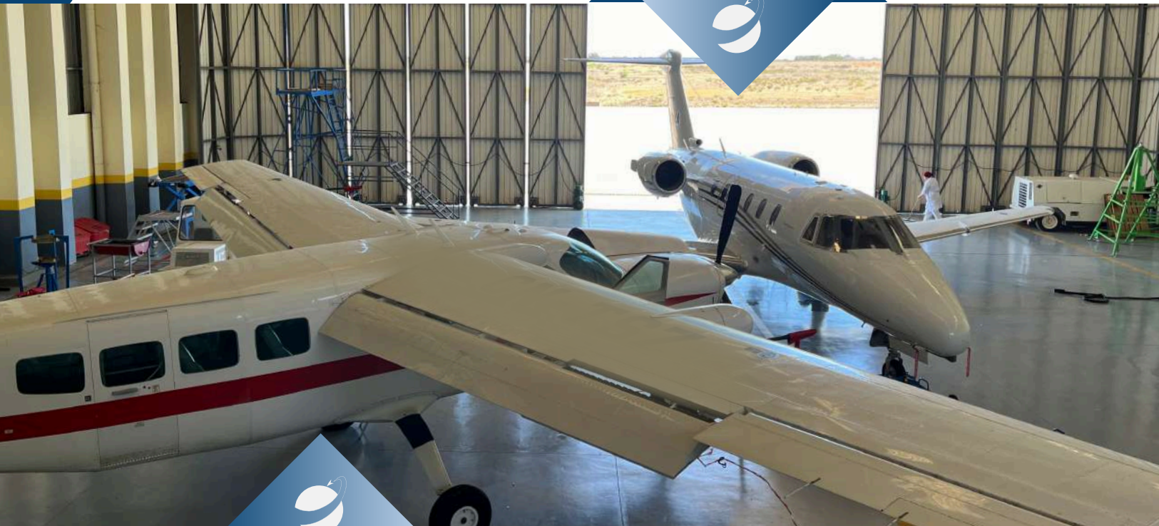
Cessna 208B (Caravan) PWC PT6

The versatility and HR expertise at Delta Aerospace give it the signature of unique performance MRO